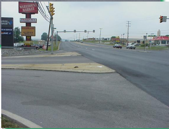
Original Redner's @ Route 61